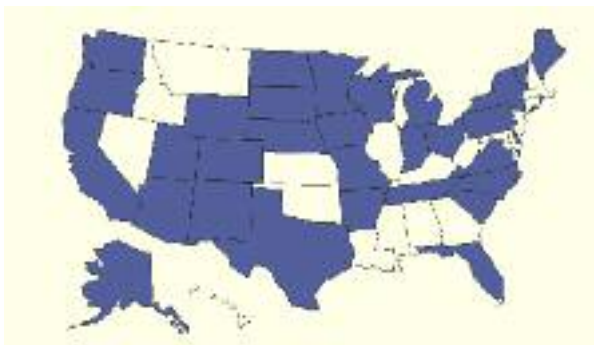
Figure 2: State Infrastructure Banks, or Equivalent, 2006